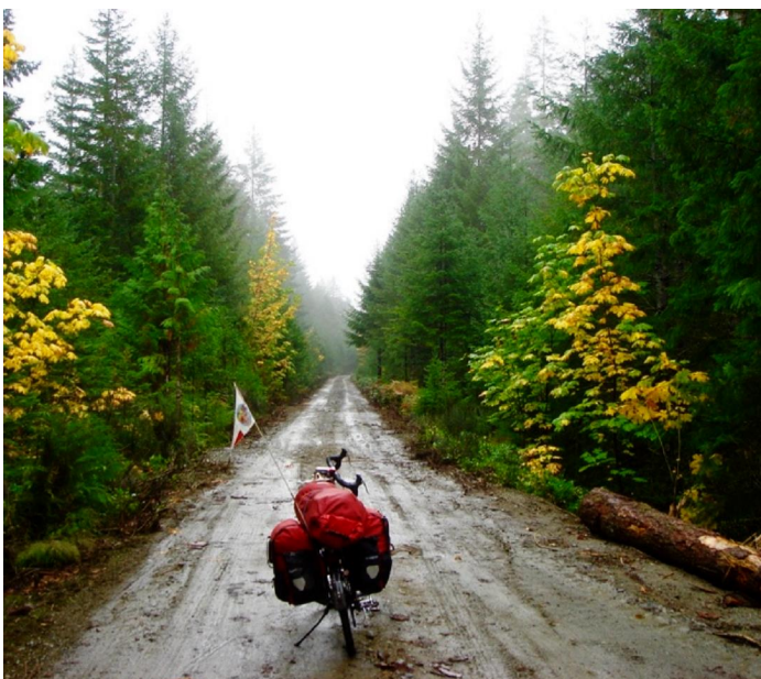
Rides off the beaten path are accessible to all levels of cyclists

Well, check out this link to Backroads Bike Touring - Vancouver Island. Or google öbackroads bike touringö ( http://www.backroadsbiketouring.com ). Do not be