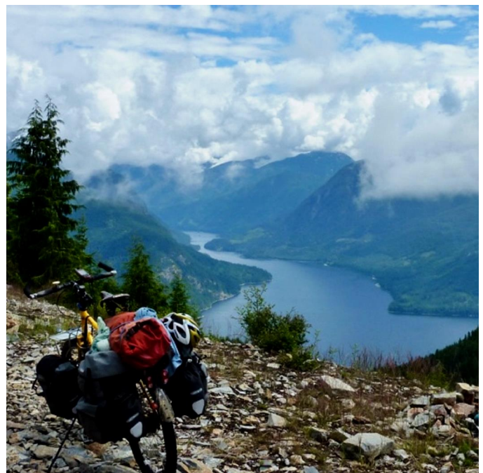
In Spipyus Provincial Park, high above the Sechelt Inlet along the Sunshine Coast