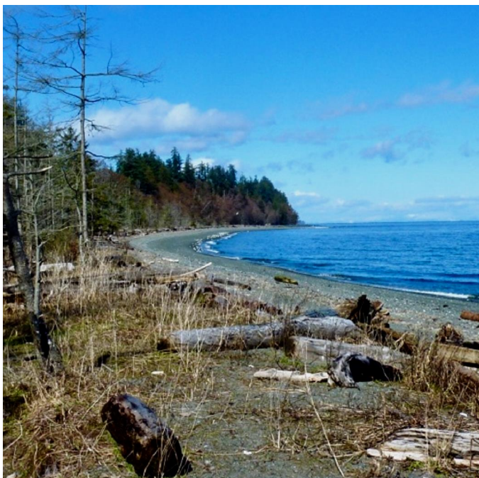
Seaside at Fillongley Campground on Denman Island, an easy ride south from Courtenay

The site starts from the premise that we have some of the best cycle touring in the world right in our own backyard. So, check out the site, & spend a little time poking around as there are a lot of corners to explore. If you like some things, share the site with friends, leave a few words on the comments page, or share a photo with other visitors. Feedback is welcome. Happy riding. http://www.backroadsbiketouring.com