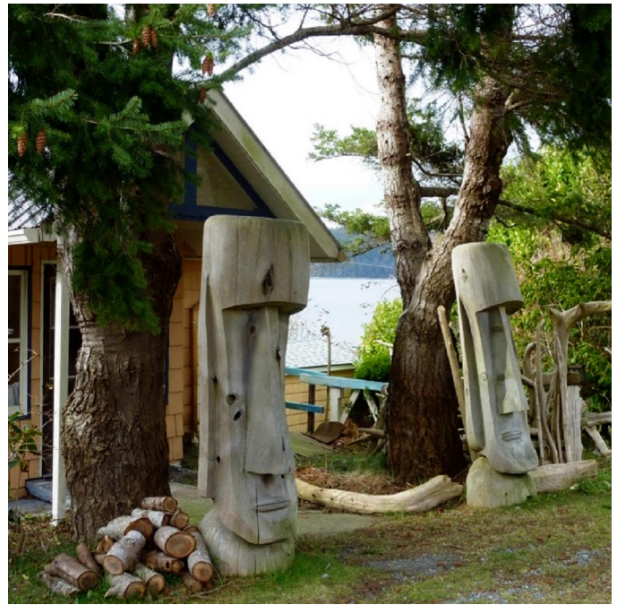
A little northern Island whimsy from Sointula, Malcolm Island

If you like to check out trip reports on Island rides, there is a blog, which includes recent trips to Denman and Hornby islands as well as and up to the North Island. Or, if you want something a little further a field, there is a world tour section with slide shows of cycle tours to some uncommon corners of the globe.