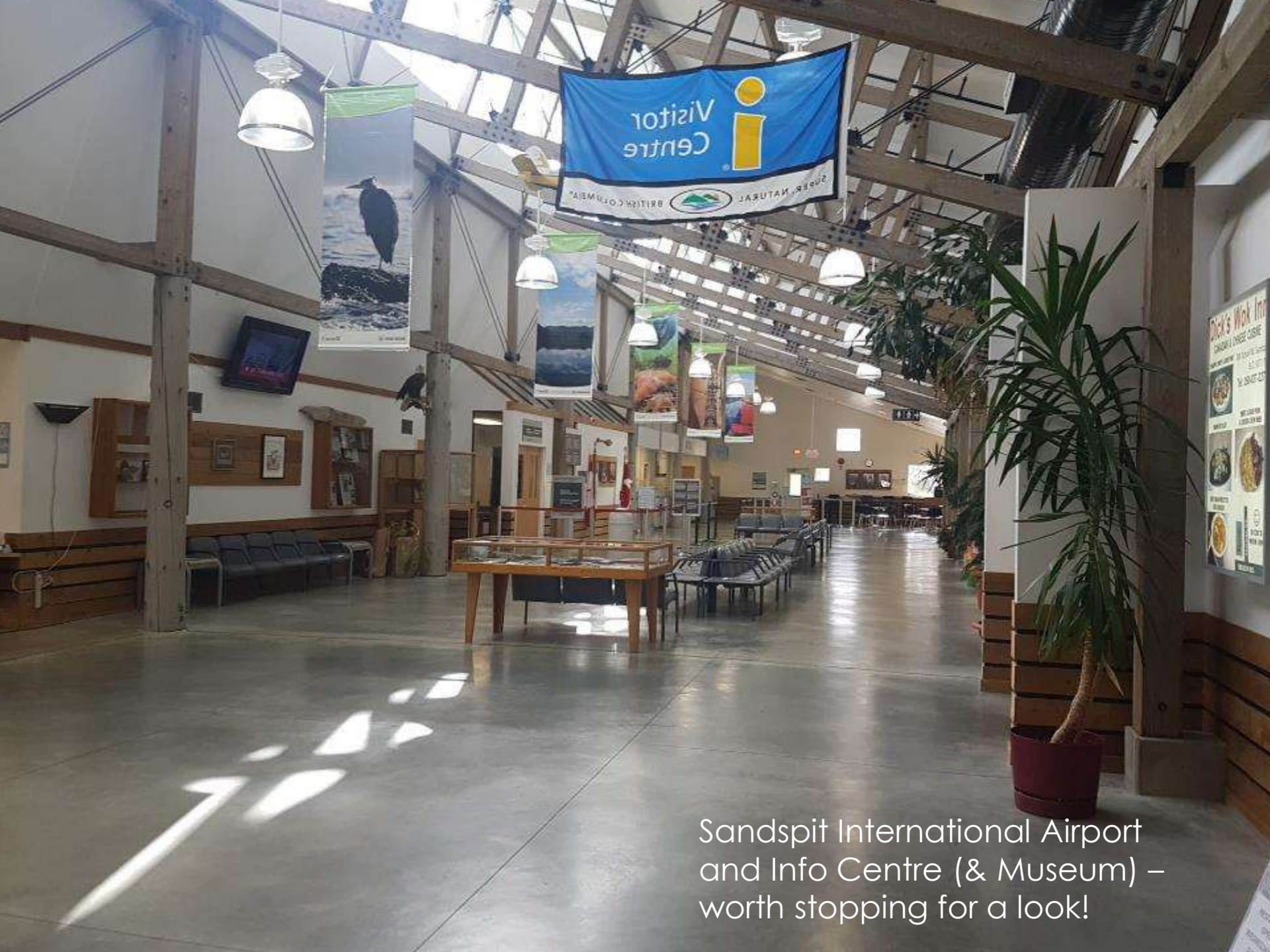
Sandspit International Airport and Info Centre (& Museum) – worth stopping for a look!