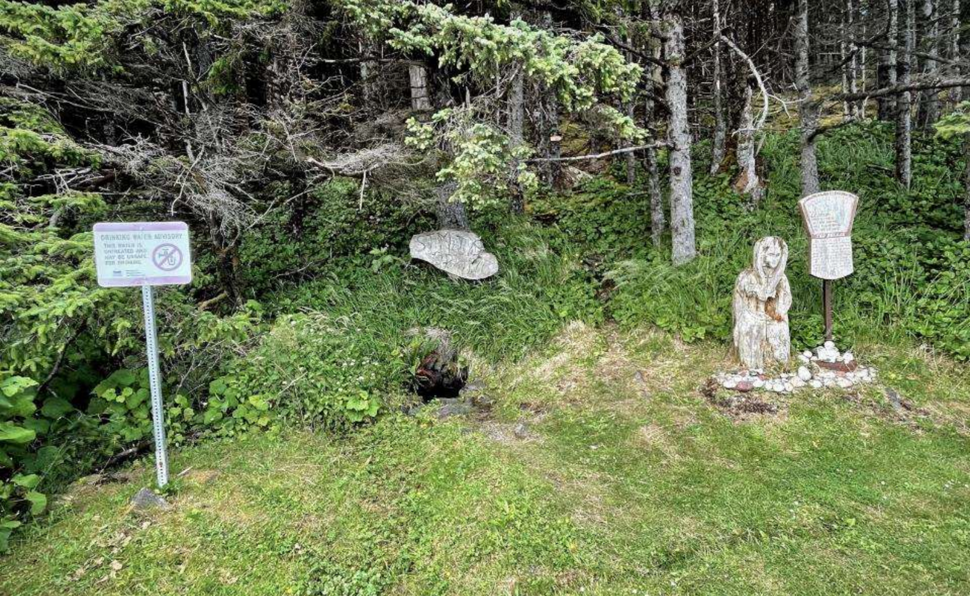
St. Mary's Spring – Legend says, "drink from the spring and you'll return to Haida Gwaii." (...the sign says the "water is contaminated")