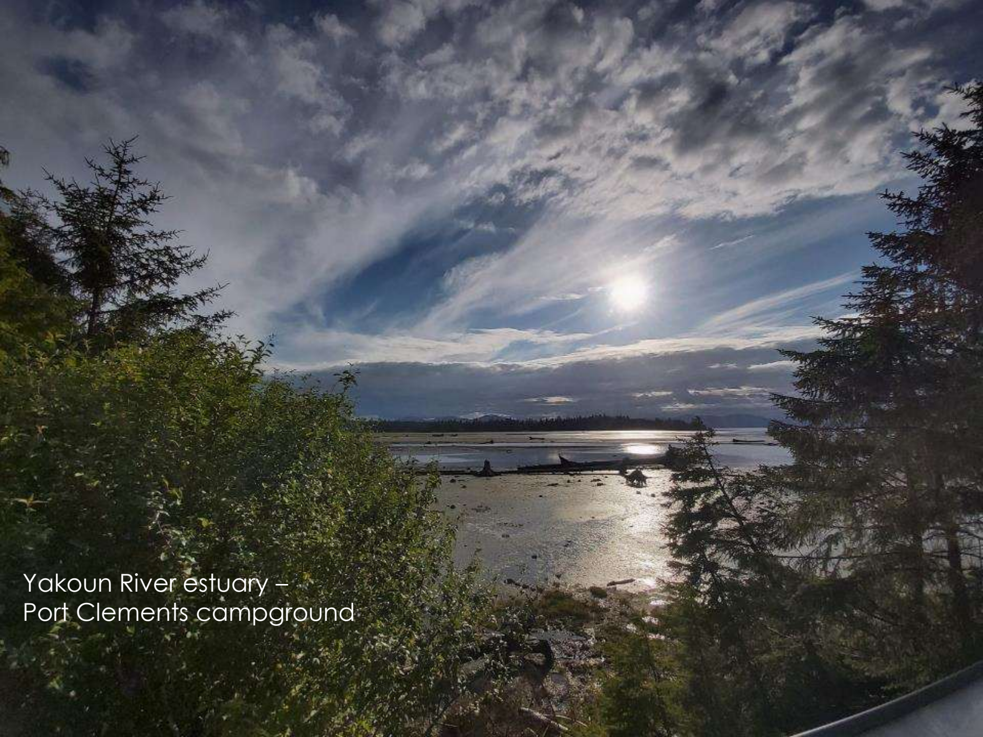
Yakoun River estuary – Port Clements campground