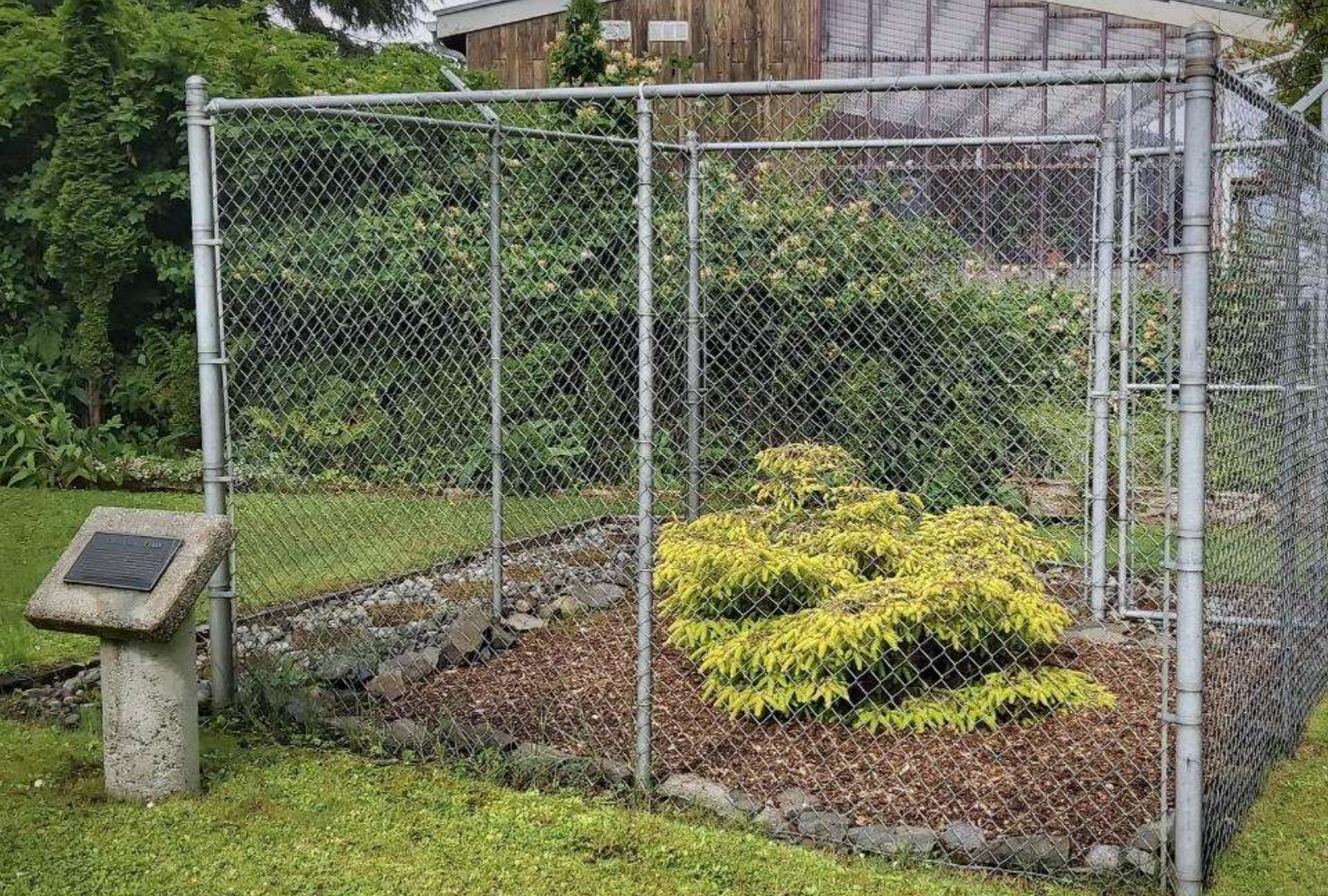
Grafted Golden spruce in a local church yard