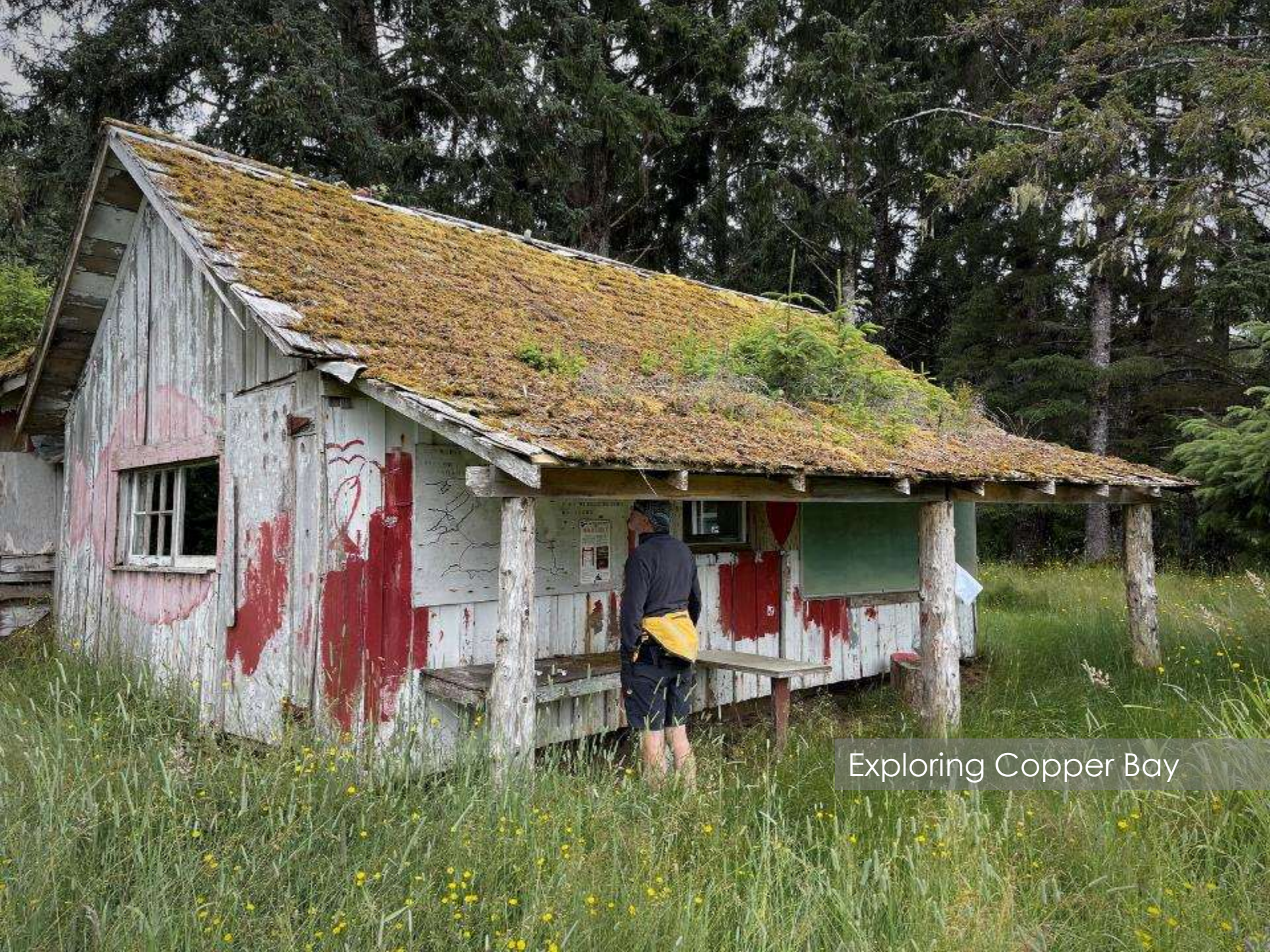
Exploring Copper Bay