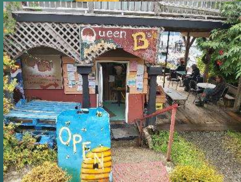
Queen Charlotte City