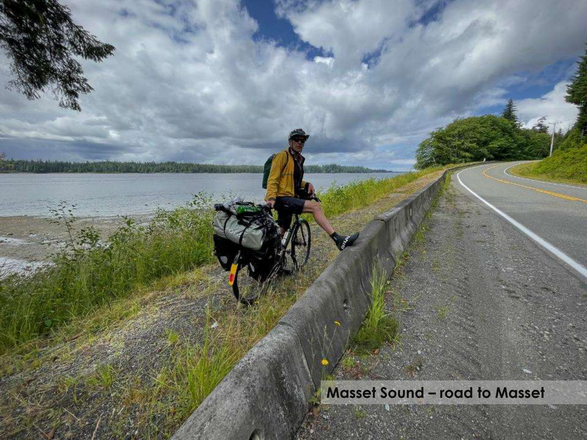
Masset Sound – road to Masset