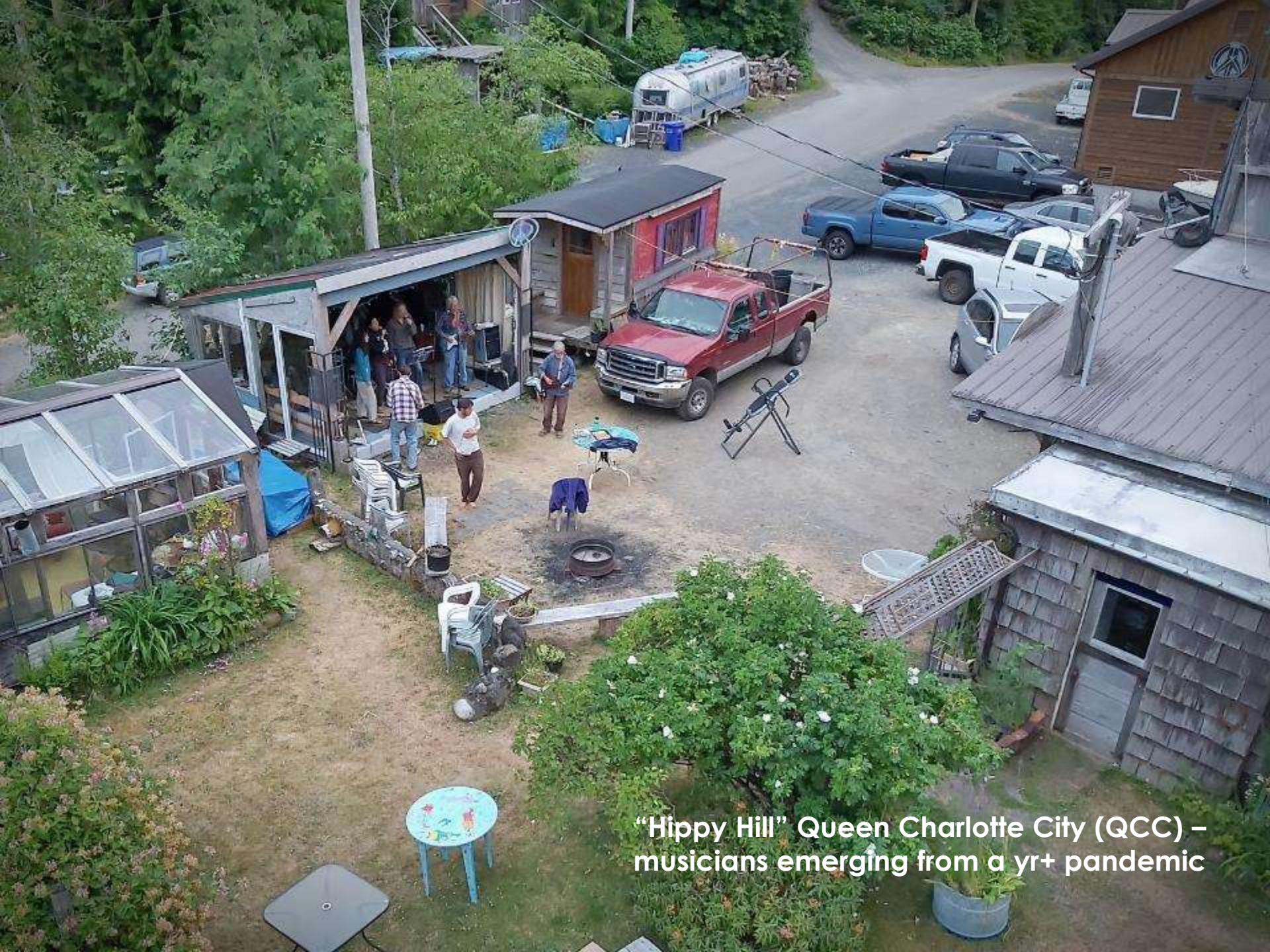
“Hippy Hill” Queen Charlotte City (QCC) – musicians emerging from a yr+ pandemic