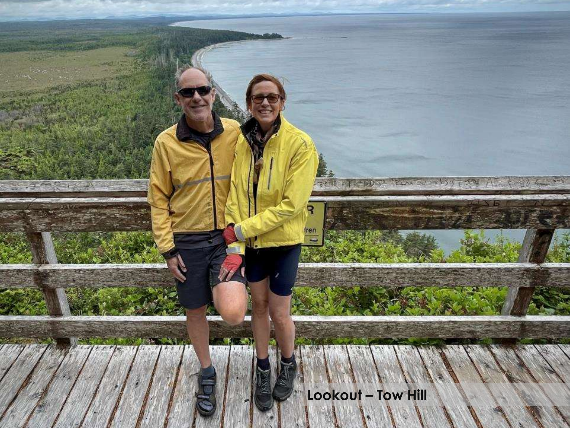
Lookout – Tow Hill