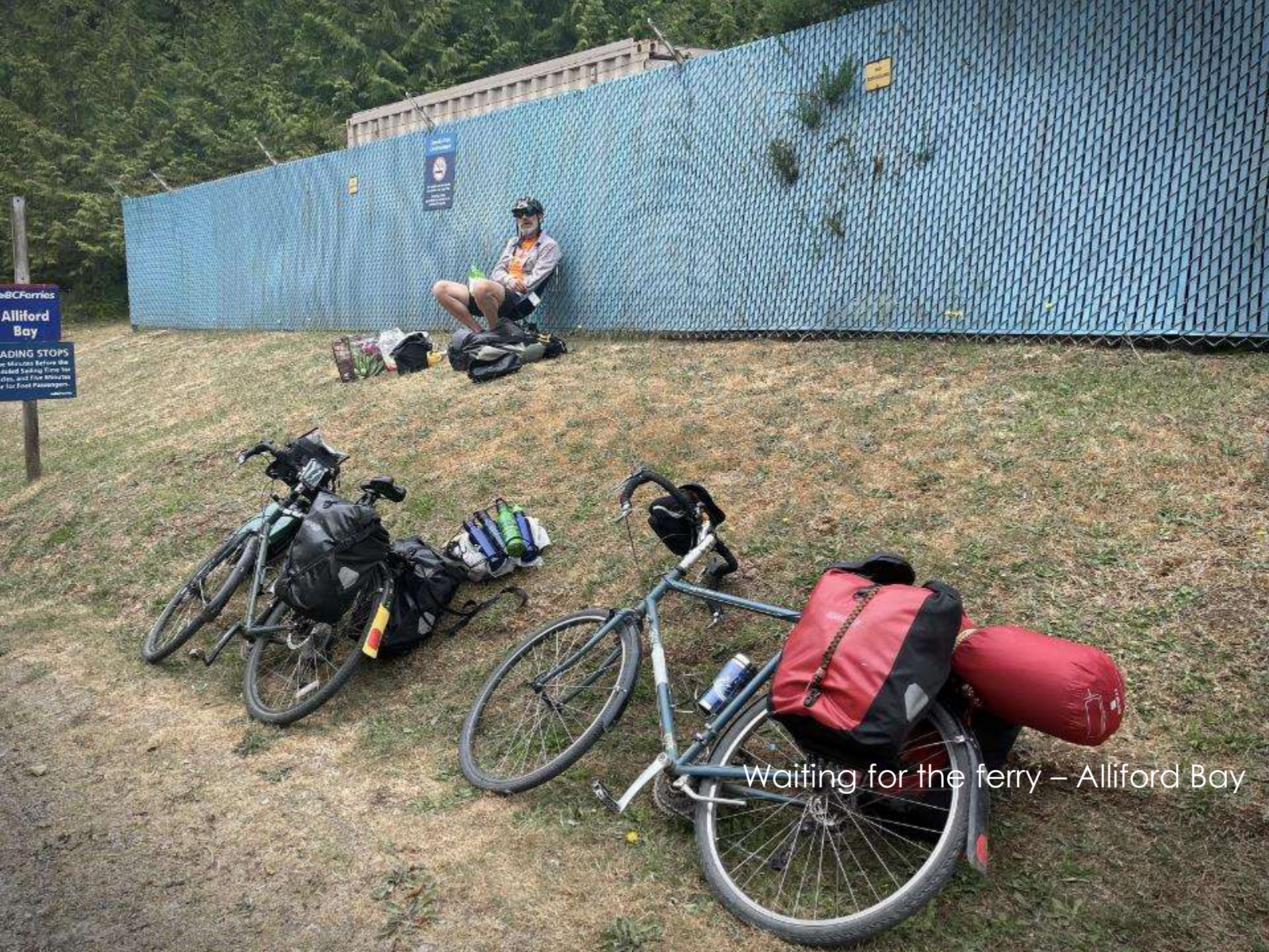
Waiting for the ferry – Alliford Bay